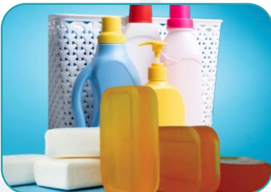
Soap & Detergent