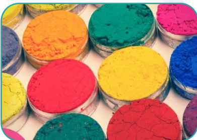
Dye-stuff & Intermediates