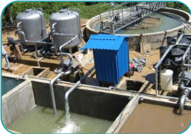
Effluent & Water Treatment