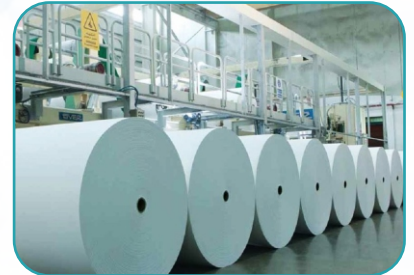
Paper, Pulp & Textile