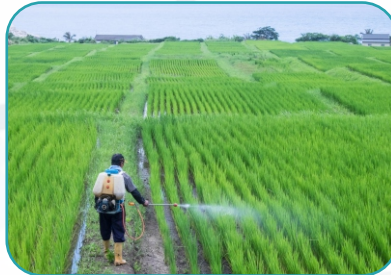
Fertilizer & Pesticides