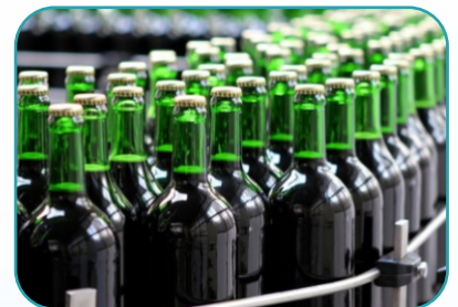
Aromatic Alcohol Manufacturing